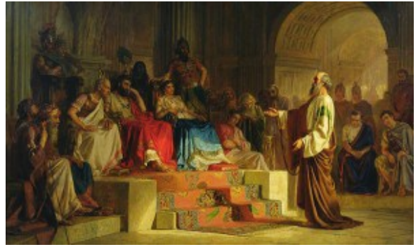
Paul defends himself before King Agrippa and Bernice

Paul: It took a long time. I did not appreciate it fully until the Lord imprisoned me in Rome (Ephesians 3.1, 4.1). Luke recorded our missionary journeys in Acts and my priority of going to Jews first with the gospel. When they rejected it, I would turn to the Gentiles (Acts 13.13-47, 18.5-6, 28.17-29). I resisted God's warnings about going to Jerusalem (Acts 20.22-23, 21.4, 7-14) and got into trouble, just as the Holy Spirit had warned. To save myself from being killed by the Jews, I had to use my Roman citizenship and appeal my case directly to Caesar (Acts 22.22-29, 25.11). The Roman commander moved me from Jerusalem to Caesarea to foil another plot of the Jews to kill me. I was imprisoned there for two years and during that time I met Governors Felix, Festus, and King Agrippa. Finally, they sent me to Rome for my appeal to the Emperor. During the voyage, a terrible storm arose. It wrecked our ship but the Lord was with us and we lost no lives. When I arrived in Rome, I immediately met with the Jews—my final meeting with them. It became clear, just as the Lord said, that they would not listen (Acts 28.17-29). This was in about 61 A.D. For the next two years I was under house arrest (a rented house) as Rome's prisoner. During this time, I spoke with many of Caesar's guards. Several came to know the Lord (Philippians 4.22). Sometimes they wondered who was the prisoner.